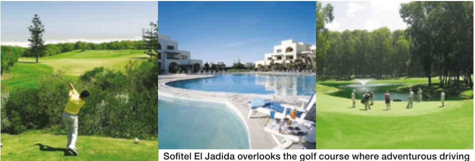
Sofitel El Jadida overlooks the golf course where adventurous driving is encouraged and quick and hard greens test your putting skills