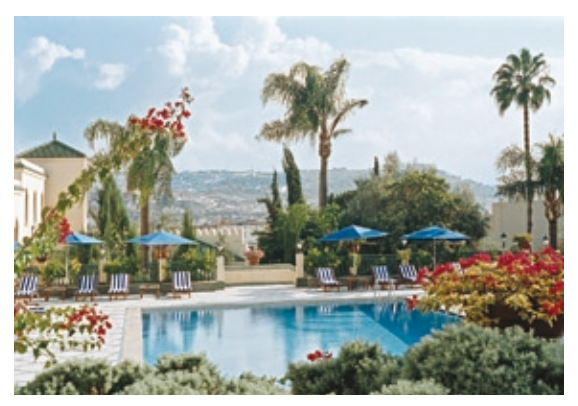
Above: The pool at the Sofitel Palais Jamais is set in a symmetrical courtyard Below: Superb views over Fez from the terrace at Sofitel Palais Jamais