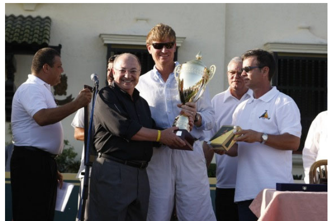
TMC 2009 winner Xavier Espot Miró with Ernie Els