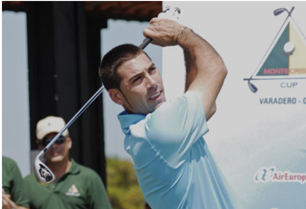
Alvaro Quiros at TMC 2010